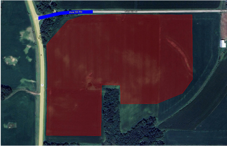
Map of Subject Road